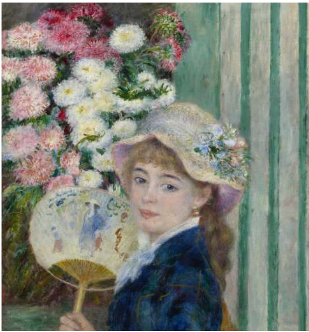
Pierre-Auguste Renoir, Girl with a Fan , 1879. Oil on canvas, 65.4 x 54 cm. Sterling and Francine Clark Art Institute