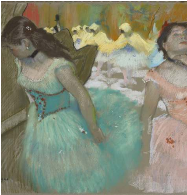
Edgar Degas, Entrance of the Masked Dancers , 1879. Pastel on gray wove paper, 49 x 64.7 cm. Sterling and Francine Clark Art Institute